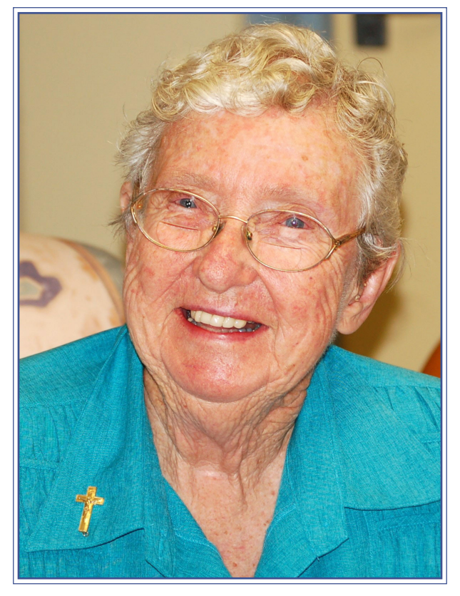
Through Him, with Him and in Him.