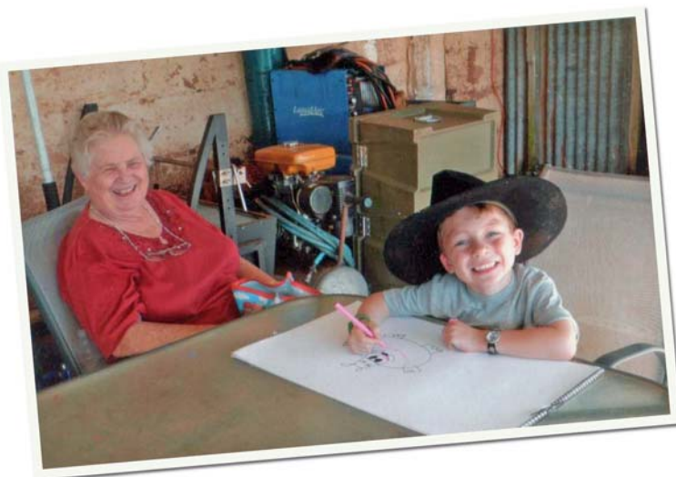
Having the last lesson of the Term on the veranda.

In the meantime, we worked on our lessons in the well-prepared classroom in a section of the dining-room. Fortunately the little boy was an eager learner and the correspondence lessons from Dubbo were excellent if the ‘Bush’ postal system managed to deliver.