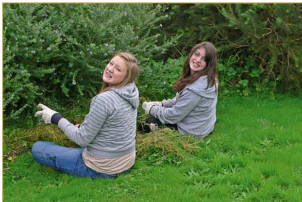
Photographs left and below: Girls from Catholic Ladies College, East Melbourne assist in the care of the grounds.

We have especially appreciated the girls help on the property in the 'Community Service' component of the Program.