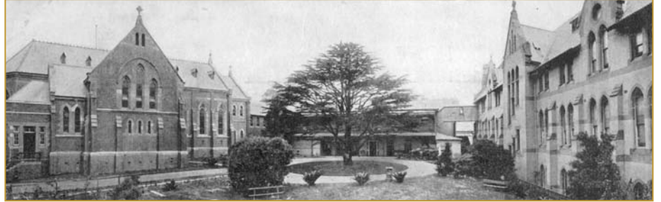
St Vincent's Chapel and College grounds, 1917.