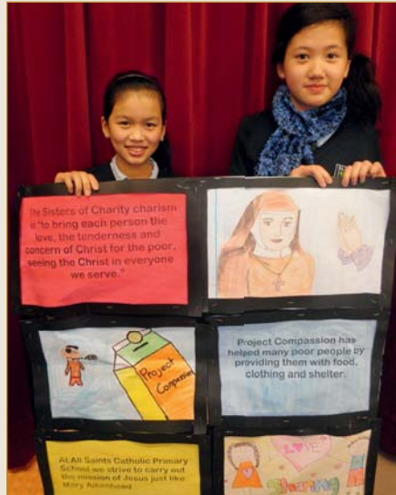
Students of All Saints Primary School, Liverpool, present their artwork which illustrates the life of Mary Aikenhead.