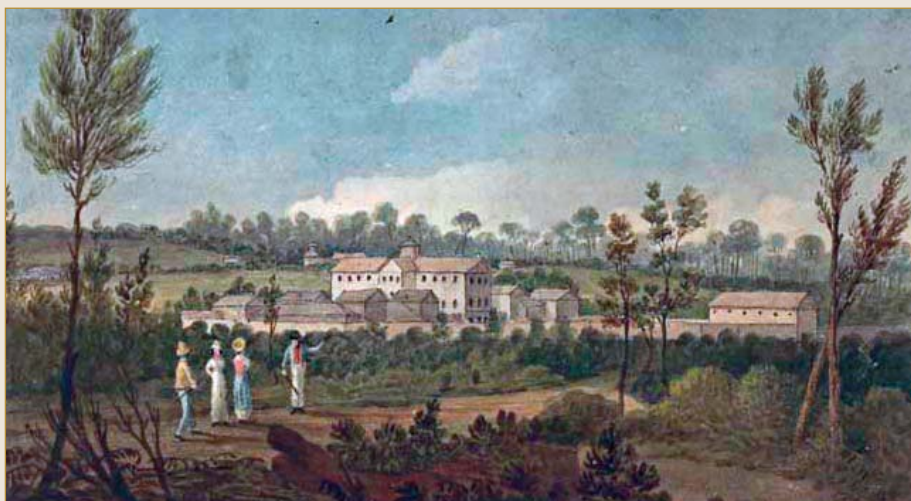
Female penitentiary or factory, Parramatta. Augustus Earle, New South Wales, 1826.