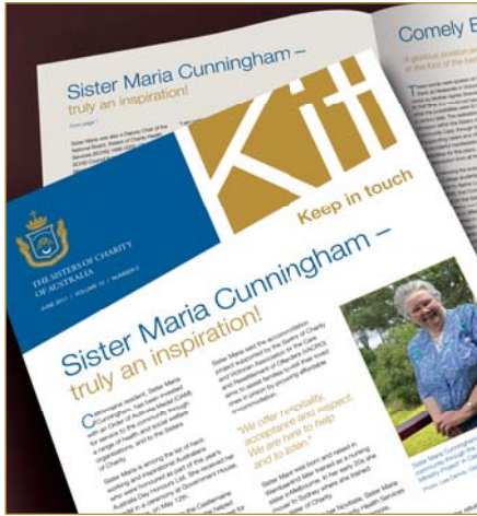
Sisters of Charity Keep in touch (June 2011)

A redesign for the Keep in touch newsletter