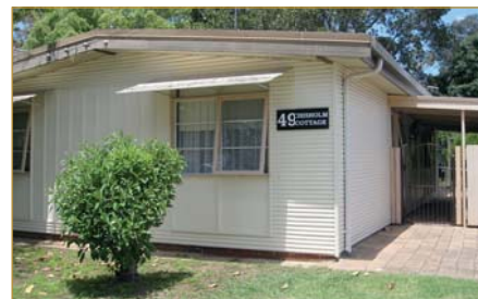
Chisholm Cottage, Westmead.