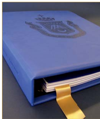
Sisters of Charity Obituaries Book

Your continued feedback on editorial content and presentation is always appreciated.