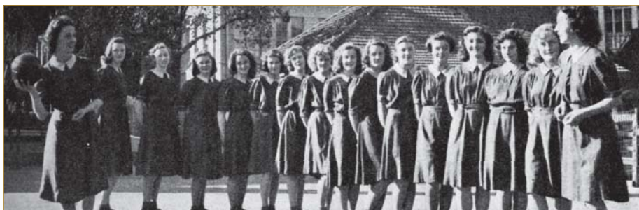
A photograph from the Archives of Catholic Ladies College, which is now at Eltham, Victoria.